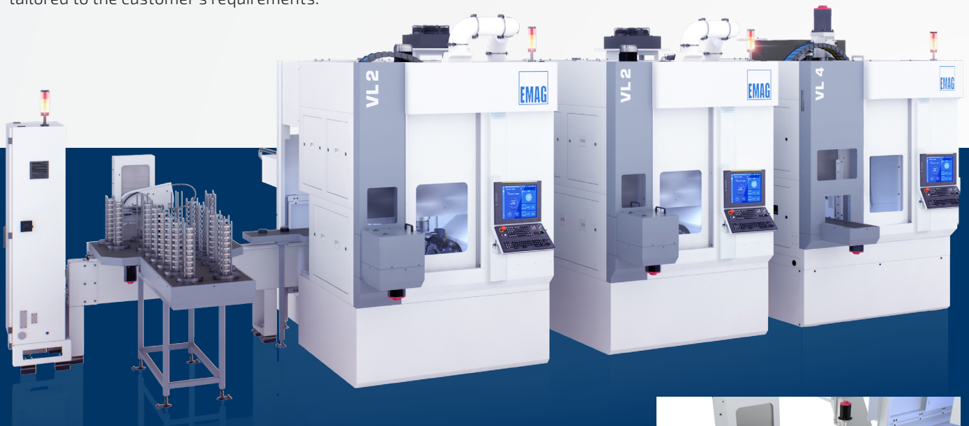
Image without safety fences

Do you want to compensate for labor shortages while simplifying processes and reducing unit production costs at the same time? Our automation solutions provide the ideal foundation for this. It is by no means necessary to commit to a large-scale system from day one. On the contrary: EMAG offers scalable automation solutions, such as EMAG's own TrackMotion or our modular robot cell. Best of all, everything comes from a single source and is provided with precision, tailored to the customer's requirements.